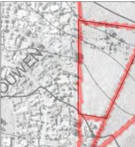
Photo Date Photographer

Detail of 1986 panorama. Dennegeur is the property below the end of the diagonal line of tall trees at centre.