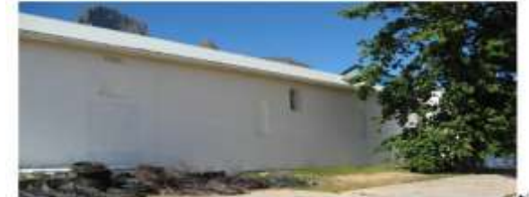
Figure 7: Imprints of the 19 th century cellar windows