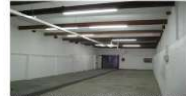
Figure 6: View of the extent of the 19 th century addition, facing eastwards