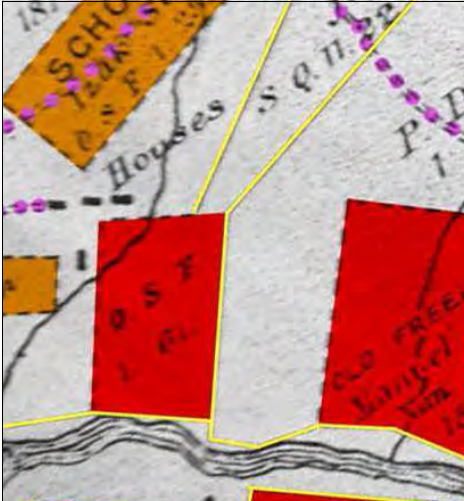
Photo Date Photographer CAM2-409